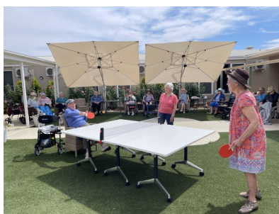
Table tennis has been a welcomed addition to our program, providing the perfect opportunity to get moving and have some fun!

There's something special about enjoying the outdoors while staying active, and what better way to do that than by playing a game of table tennis out in the sunshine!